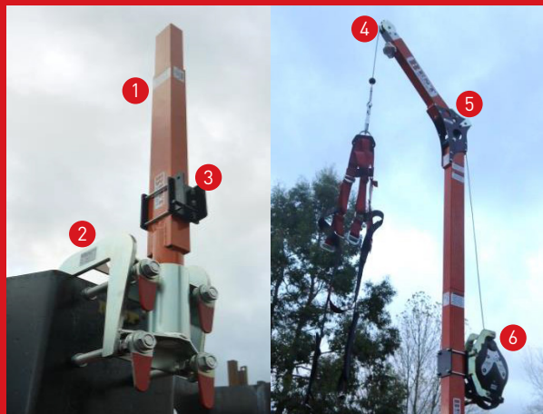
1. Lower Davit Pillar; 2. Lightweight Davit Clamp; 3. Mounting Bracket; 4. Pulley; 5. Upper Davit Pillar and Arm; 6. Fall Arrest and Recovery Device.

Following an inspection, if there is any doubt on the serviceability of any component part of the system, it must be